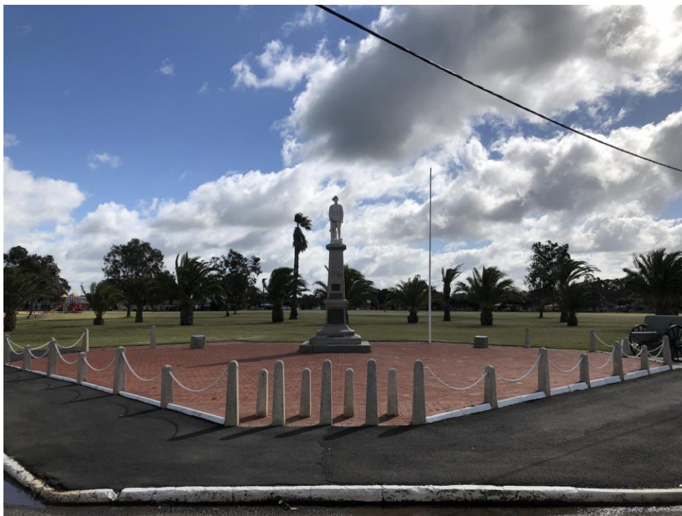
Katanning War Memorial