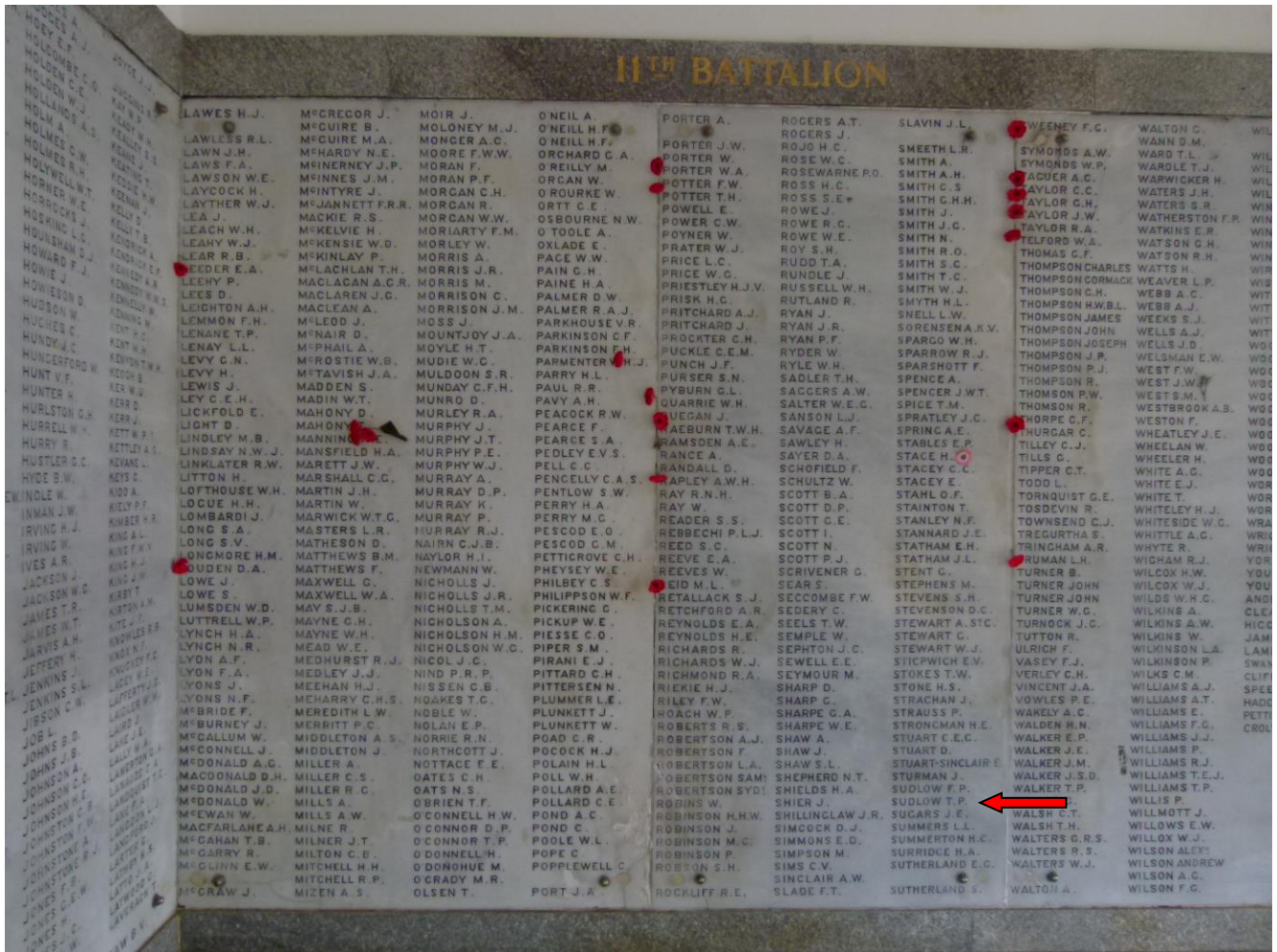
11th Battalion Roll of Honour in Crypt at King's Park, Western Australia